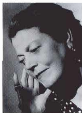
Eileen J. Garrett

As an anniversary tribute and with the realization that current generations have not had the benefit of her first-hand account, Eileen Garrett's early autobiography Adventures in the